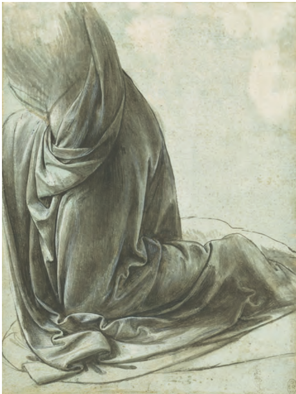
Leonardo da Vinci, The drapery of a kneeling figure, c.1491-94

'Leonardo da Vinci: A Life in Drawing' is a nationwide event which will give the widest-ever UK audience the opportunity to see the work of this extraordinary artist. To mark the 500th anniversary of the death of Leonardo da Vinci, the Royal Collection Trust has selected Sunderland Museum, Library & Winter Gardens to be one of 12 UK venues to host simultaneous exhibitions of 12 Leonardo da Vinci drawings.